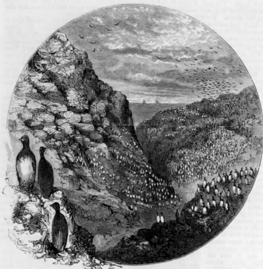
THE GREAT BROOKERY.

the female on the nest, and also watches to resist the attacks of the gull, which not only destroys the eggs, but also eats the young. The murre feeds on sea-grass and jelly-fish, and I was assured that though some hundreds had been examined at different times, no fish had ever been found in a murre's stomach.